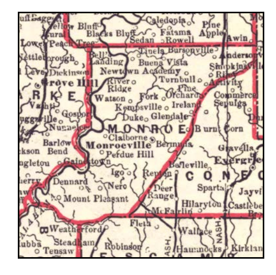
People's Publishing, 1889