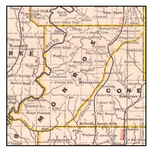
Hudgins & Company, 1882