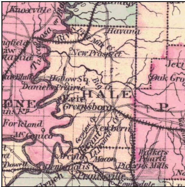
Taintor Brothers & Merrill, 1870