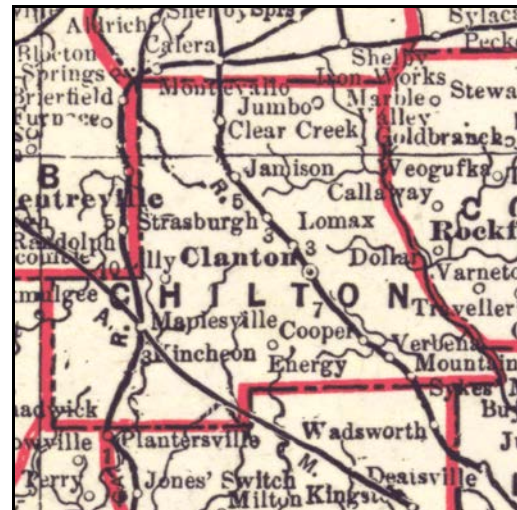
People's Publishing, 1889