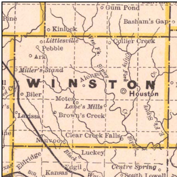
Hudgins & Company, 1882