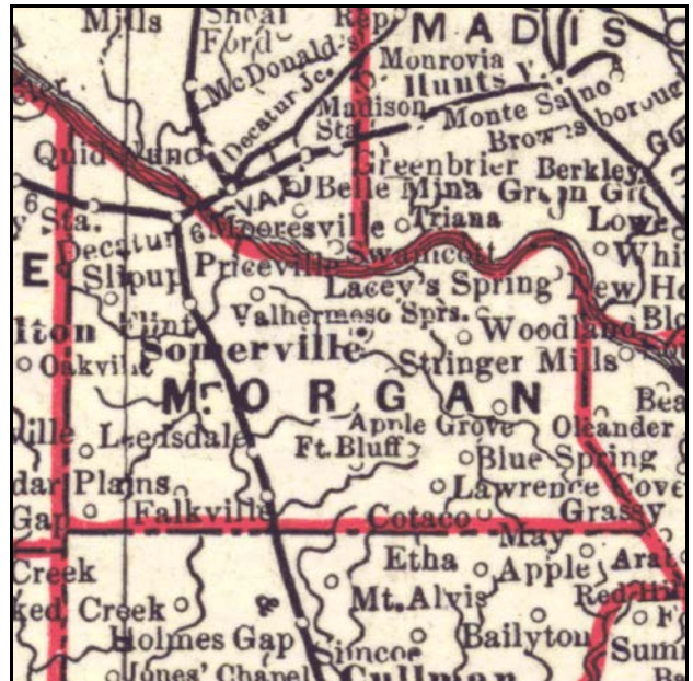
People's Publishing, 1889