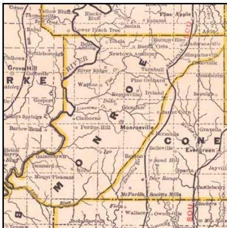
Hudgins & Company, 1882