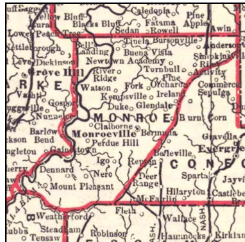
People's Publishing, 1889