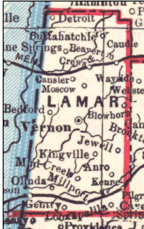
People's Publishing, 1889