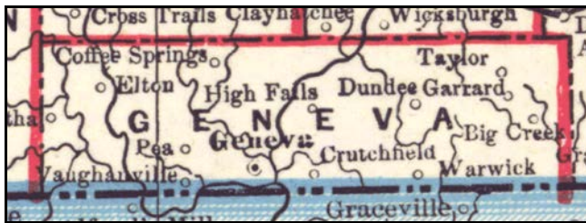
People's Publishing, 1889