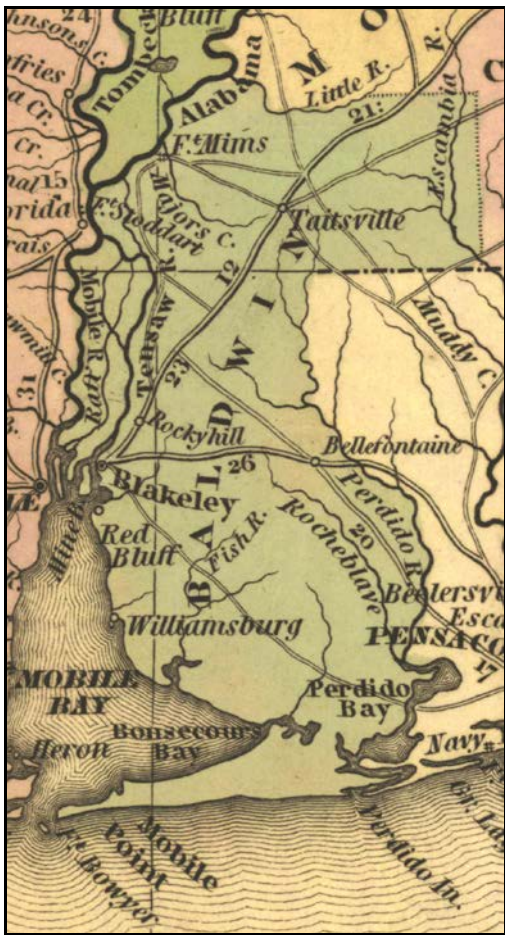
Henry Schenk Tanner, 1836