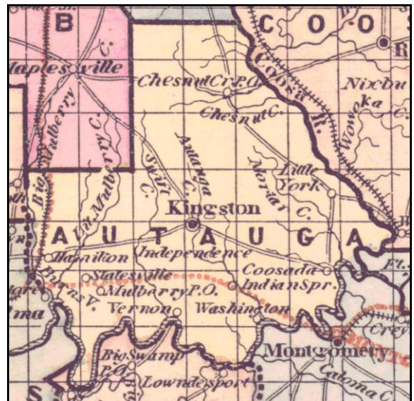
Sidney Edwards Morse, 1856