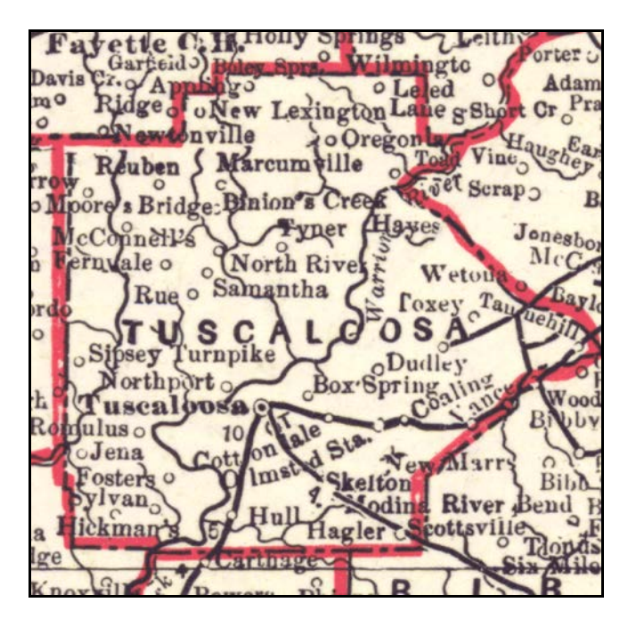
People's Publishing, 1889