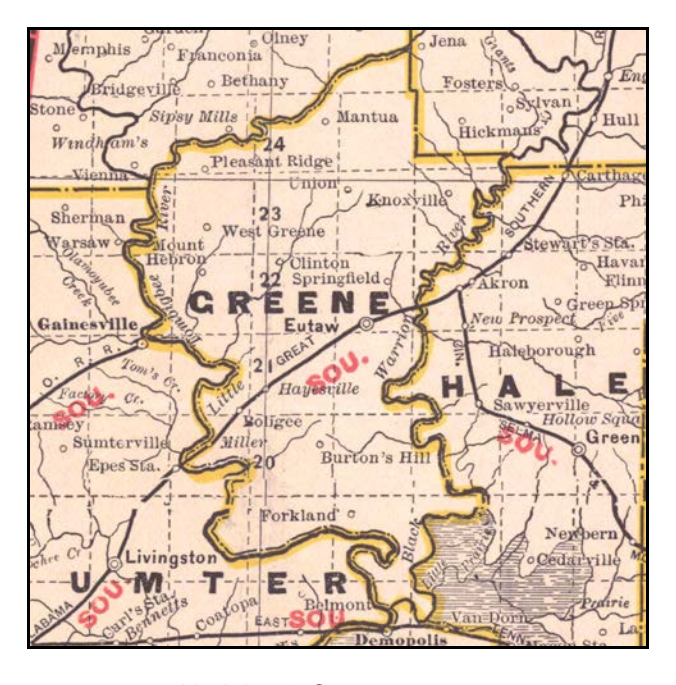
Hudgins & Company, 1882