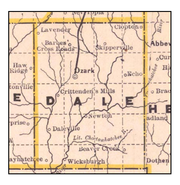
Hudgins & Company, 1882