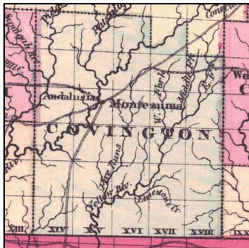
Taintor Brothers & Merrill, 1870