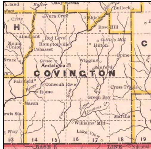
Hudgins & Company, 1882