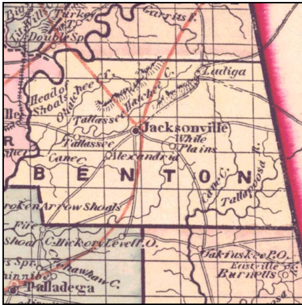
Sidney Edwards Morse, 1856