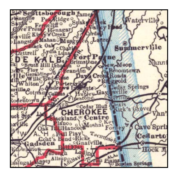
People's Publishing, 1889